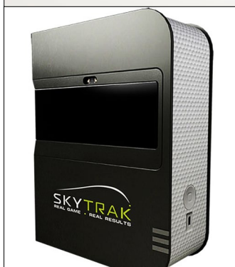
Launch monitor main units