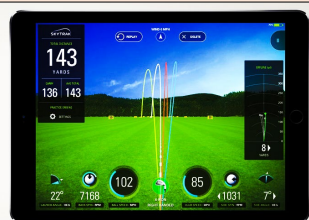
SKYTRAK app on iPad